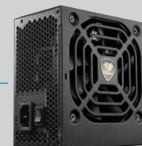
PS2 ATX Type (up to 140mm long)