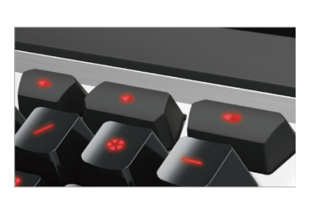
INDEPENDENT VOLUME KEYS Three dedicated keys allow you to mute, increase or décrease volume.