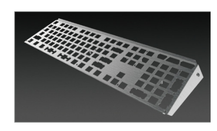
EXPOSED ALUMINUM BRUSHED

The mechanical key modules are mounted on an exposed aluminium structure with premium brushed surface treatments. This sturcture helps to increase typing efficiency, apart form making the keyboard more sturdy and giving it a distinctive look.